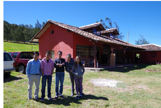
The quinta at the new Bible School facility

beautiful old adobe quinta out in the country with lots